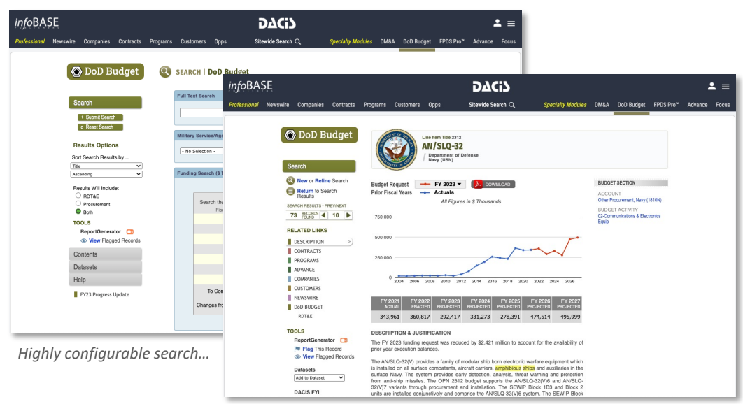
... delivers line-item details and all DACIS linkages.

Seamless integration with all DACIS modules, DACIS DoD Budget exposes line-item details on all Pentagon spending relative to Research, Development, Test & Evaluation (RDT&E) and Procurement. The result is a constantly updated source of where spending is happening, where trends are occurring, and where opportunities are waiting.